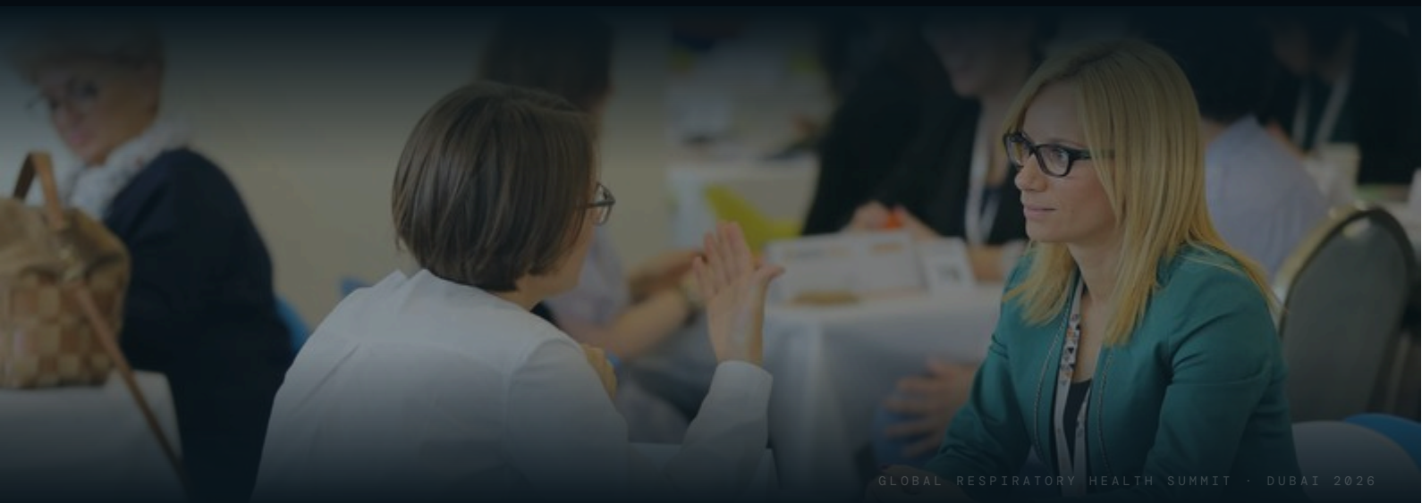
GLOBAL RESPIRATORY HEALTH SUMMIT · DUBAI 2026